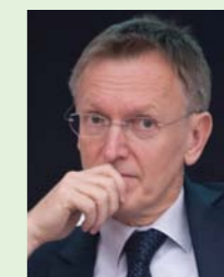
Mr Janez Potočnik, European Commissioner for Environment

Investing in natural capital, especially in countries such as yours, which have rich biodiversity, will underpin many opportunities for sustainable development in the future.